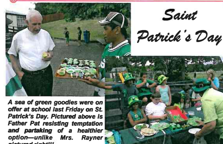
Saint Patrick's Day

For more information email admin@sacredheart.school.nz.